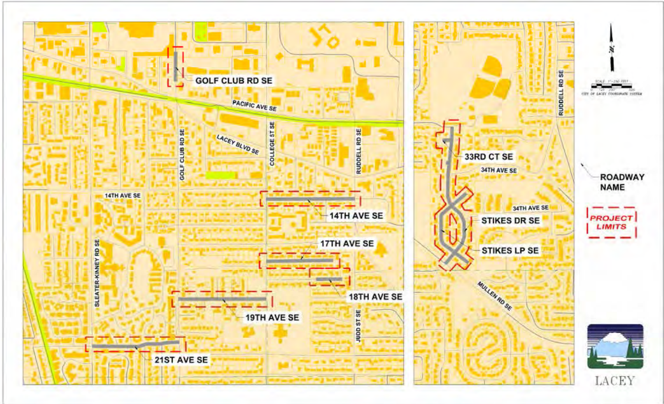
2018 Overlay Project Fig 1